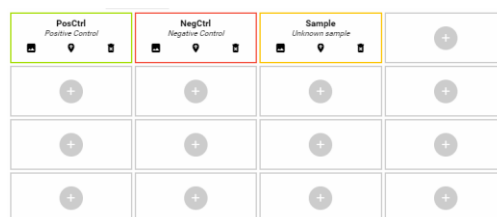
Fig 1. Cartridge set-up

An example of cartridge set-up on the bAPP for one replicate of a sample to be analyzed is shown.